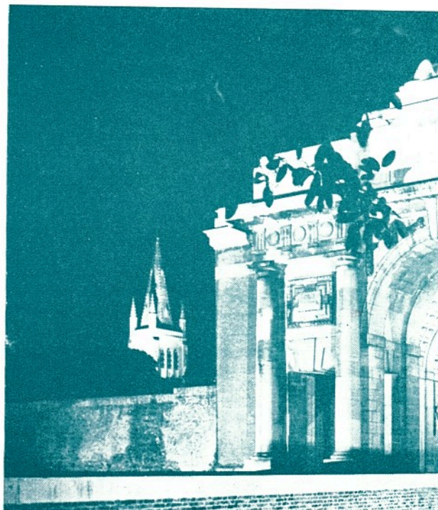
THE YPRES (MENIN GATE) MEMORIAL Australian casualties commemorated Total Commonwealth