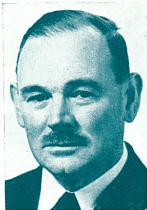
The Right Honourable P. M. Hasluck, Australian Minister for External Affairs and Joint Patron of the A.I.F. Remembrance Pilgrimage. Formerly Minister for Territories (May 1951 - Nov. 1963) and Minister for Defence (Nov. 1963 - April 1964). Liberal Party Member of the House of Representatives for Curtin, Western Australia.

I was very pleased to be asked to contribute a message as a foreword to the Official Programme of the Pilgrimage of the 50th Anniversary of the Battle of the Somme.