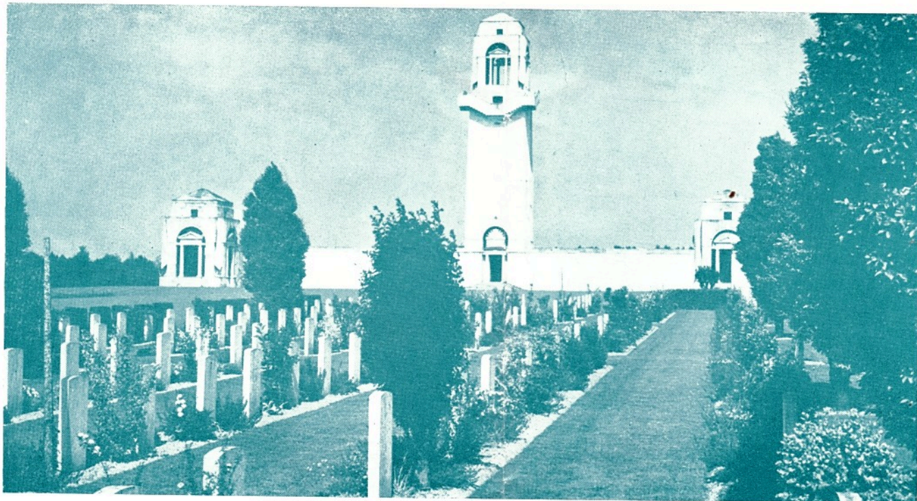
VILLERS BRETONNEUX MILITARY CEMETERY AND THE AUSTRALIAN NATIONAL MEMORIAL Total number of casualties commemorated on the Memorial 10,825 (all Australians)