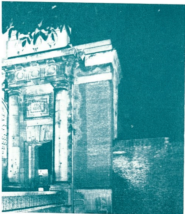
MEMORIAL, BELGIUM erated 6,115 s commemorated, 54,371