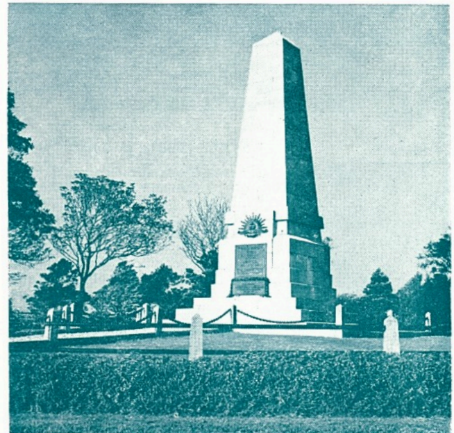
THE THIRD AUSTRALIAN DIVISION MEMORIAL, SAILLY-LE-SEC, FRANCE

"They gave their lives. For that public gift they received a praise which never ages and a tomb most glorious—not so much the tomb in which they lie, but that in which their fame survives, to be remembered for ever when occasion comes for word or deed . . ."