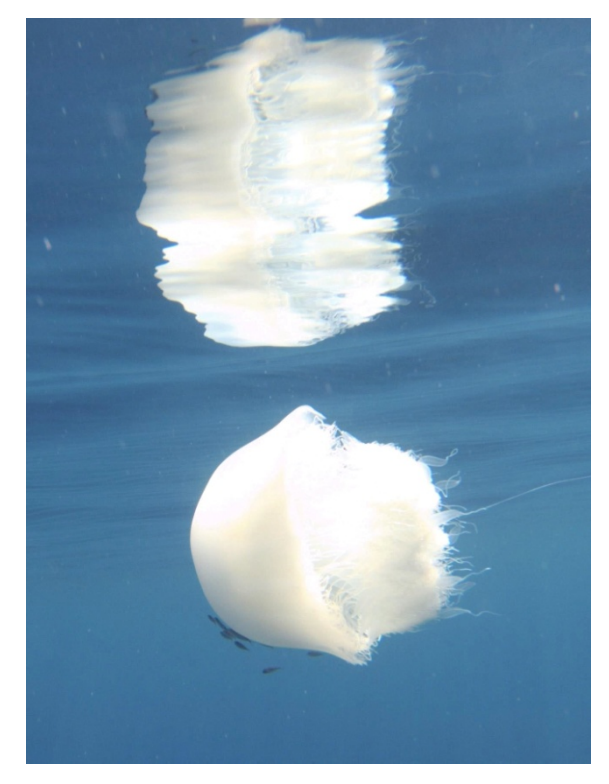
Figure 3. Specimen of Rhopilema nomadica spotted at the surface within Cala Minnola on the island of Levanzo within the Aegadian archipelago.

On the 26 October 2015, a large specimen of R. nomadica (with an umbrella of ~40 cm in diameter, Figure 2) was sighted at the surface at Poetto (Supplementary material Table S1). The specimen, identified through observation and photographic documentation, was recorded during the regattas of the Techno 293 World Windsurfing Championship, with the sea temperature on the day being that of 26 °C. The sighting of this single individual was reported in a local newspaper on 27 October 2015 (http://lanuo vasardegna.gelocal.it/cagliari/cronaca/2015/10/27/news /avvistata-nelle-acque-della-sardegna-una-pericolosamedusa-gigante-del-mar-rosso-1.12340691) and within the non-scientific literature through the ICES Working Group on Introductions and Transfers of Marine Organisms (ICES 2016).